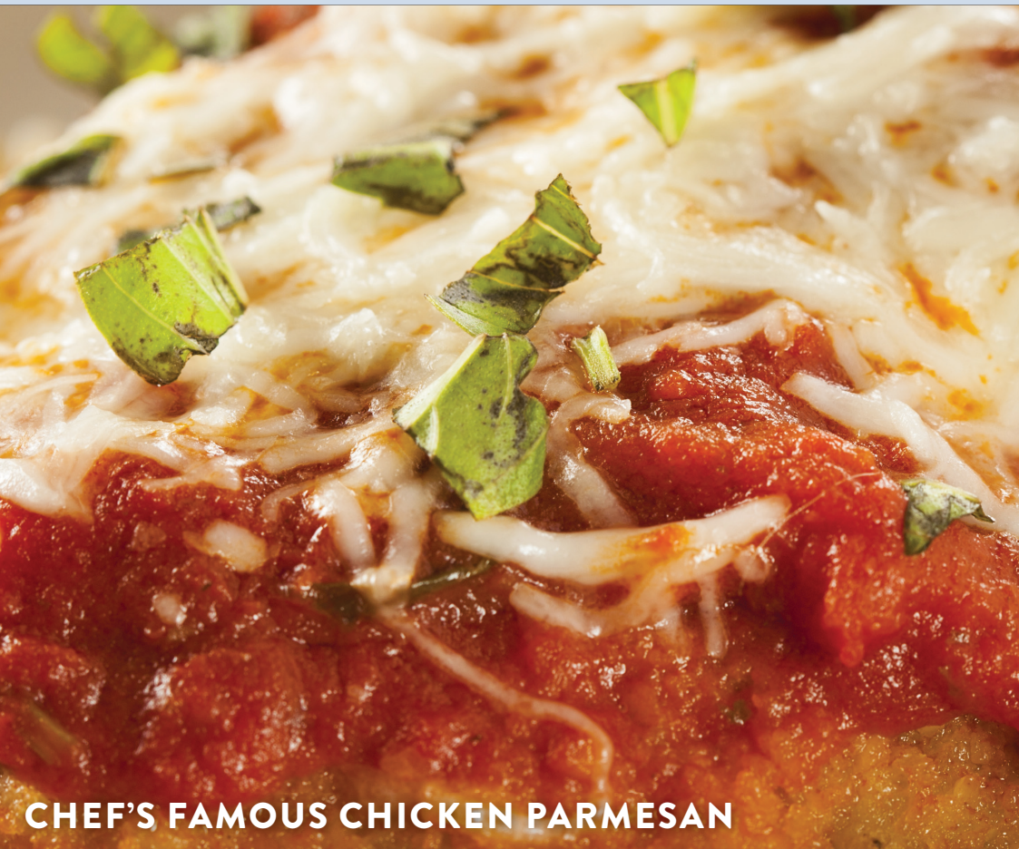
CHEF'S FAMOUS CHICKEN PARMESAN